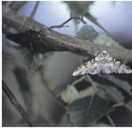
Cautionary tale: the classic account of industrial melanism in the peppered moth now looks flawed.

From time to time, evolutionists re-examine a classic experimental study and find, to their horror, that it is flawed or downright wrong. We no longer use chromosomal polymorphism in Drosophila pseudoobscura to demonstrate heterozygous advantage, flower-colour variation in Linanthus parryae to illustrate random genetic drift, or the viceroy and monarch butterflies to exemplify Batesian mimicry. Until now, however, the prize horse in our stable of examples has been the evolution of ‘industrial melanism’ in the peppered moth, Biston betularia , presented by most teachers and textbooks as the paradigm of natural selection and evolution occurring within a human lifetime. The re-examination of this tale is the centrepiece of